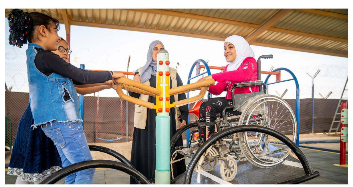
In 2018, UNICEF opened the first fully inclusive playground for children with disabilities in Za'atari Refugee Camp in Jordan as part of national efforts to make education inclusive for all children.

The Guidelines can be used by UN personnel in all their communications, when they send emails and meeting notes, prepare documents, participate in community consultations, communicate through digital platforms, or run multi-channel campaigns that exploit a range of media. Supported by best practices and examples, they provide guidance on how to respect disability etiquette and create inclusive and accessible content.